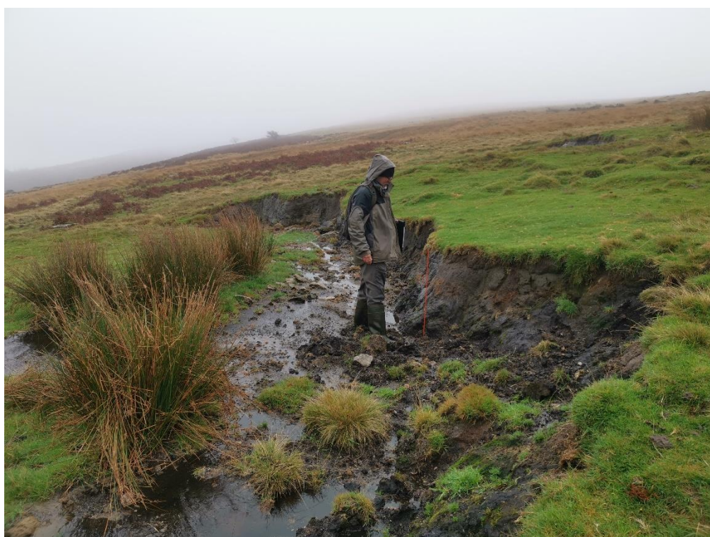
Plate 8 Erosion gully at 2a with 1m exposed peat and damp grassland above (note wetland/heathland habitat in background)