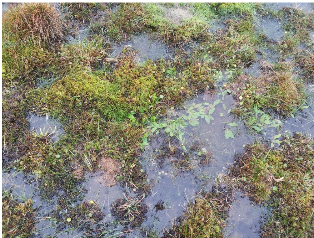
Plate 13 M29 soakway and M6a mire mosaic below 2c.