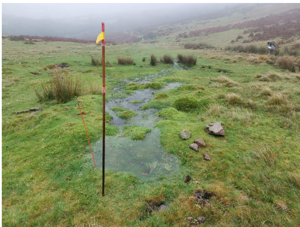
Plate 1 Head of Scad Brook.