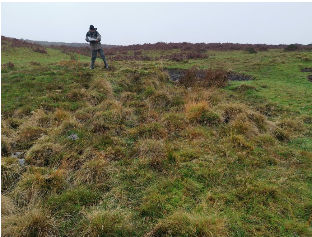
Plate 3 Short sedge acidic fen (M6a) and smaller peat gully at second spring head.