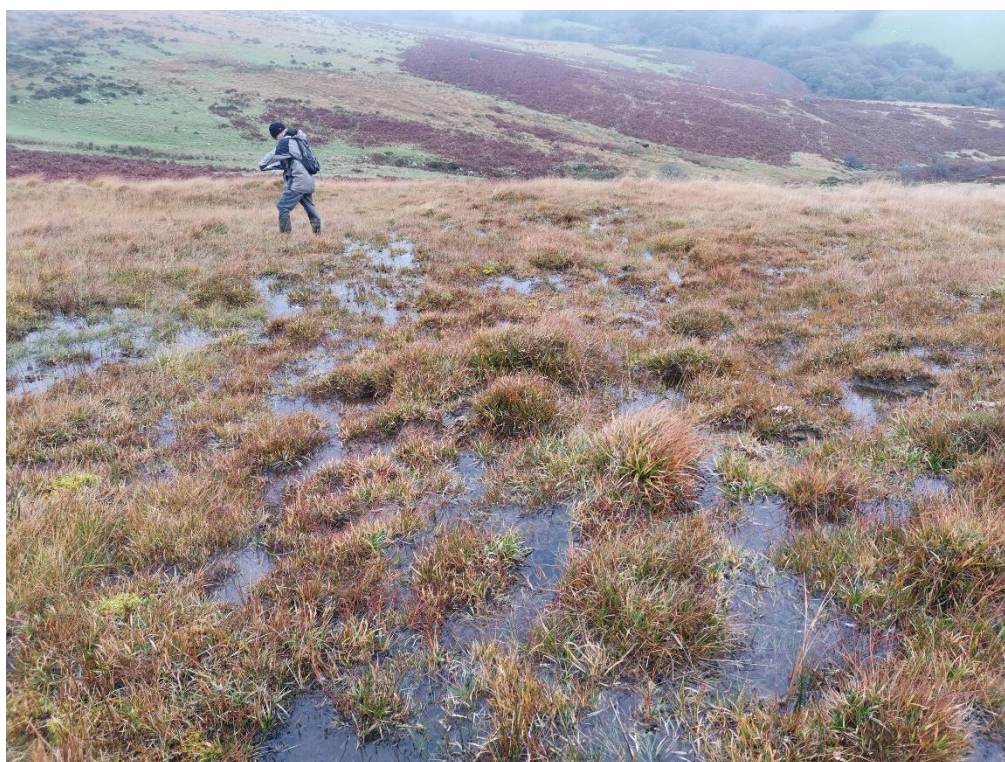
Plate 14 Waterlogged M6a mire on lower slopes