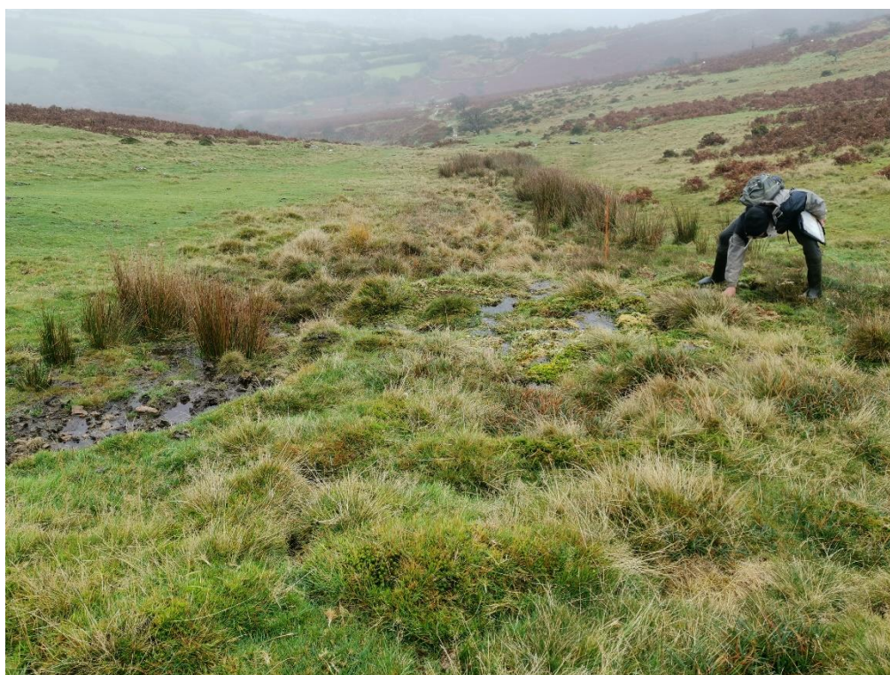
Plate 5 View down Scad Brook (East) with water track entering from north (left).