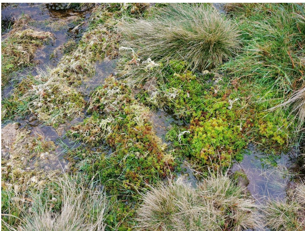
Plate 4 Close-up of above: highly waterlogged and rich in Sphagnum moss