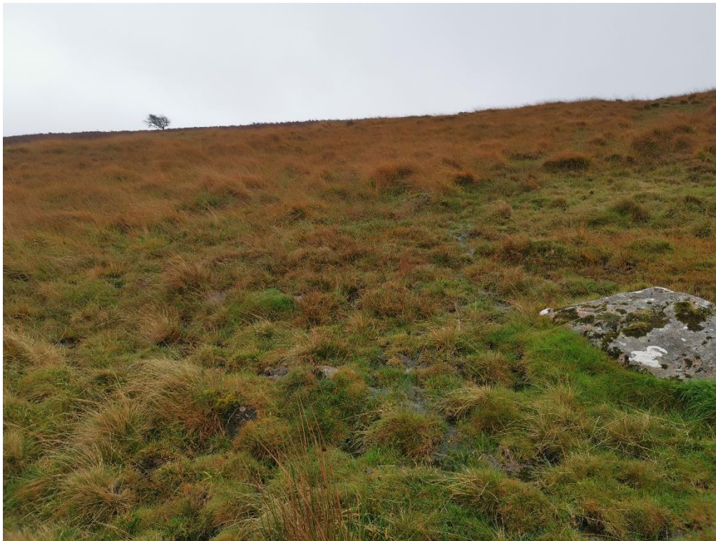
Plate 15 Lower mire grading into acid grassland – high cover of purple moor-grass