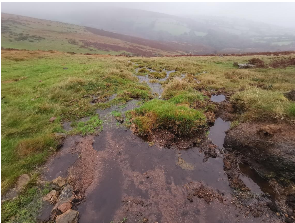
Plate 9 Damp acid grassland below erosion gully at 2a – poor habitat and eroded peat