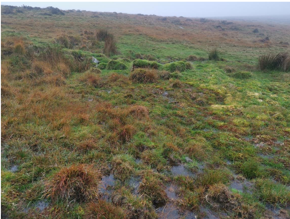
Plate 12 Highly waterlogged mire just below the spring at 2c.