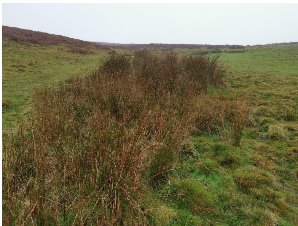
Plate 6 Soft rush dominating mire further down Scad Brook (looking West) (M6c)