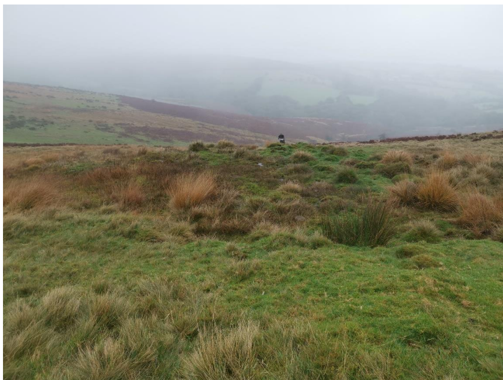
Plate 7 Spring at site 2a with mire vegetation (centre of image)