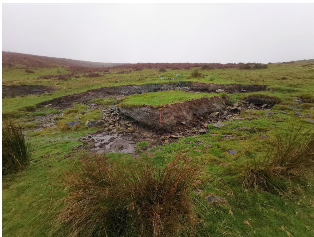
Plate 2 Peat hag /erosion gully just below the Spring head with deep peat exposed.