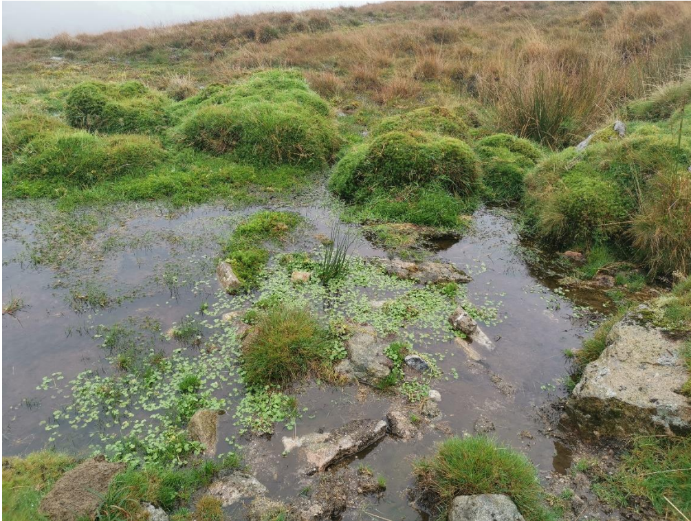
Plate 11 Rill community in pool at 2b