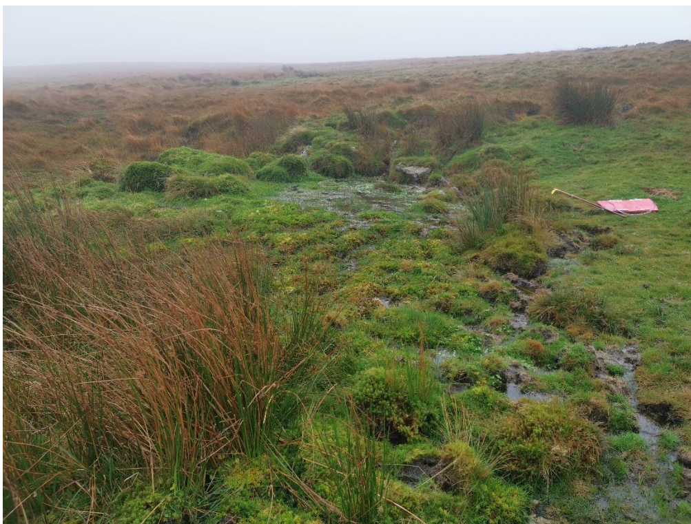
Plate 10 Pool below spring head at site 2b – M35 rill community surrounded by fen.